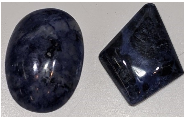
Scott's Glaucophane & Sodalite cabs