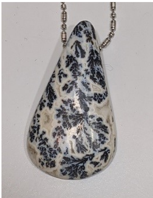
Jenny's blue dendrite pendant