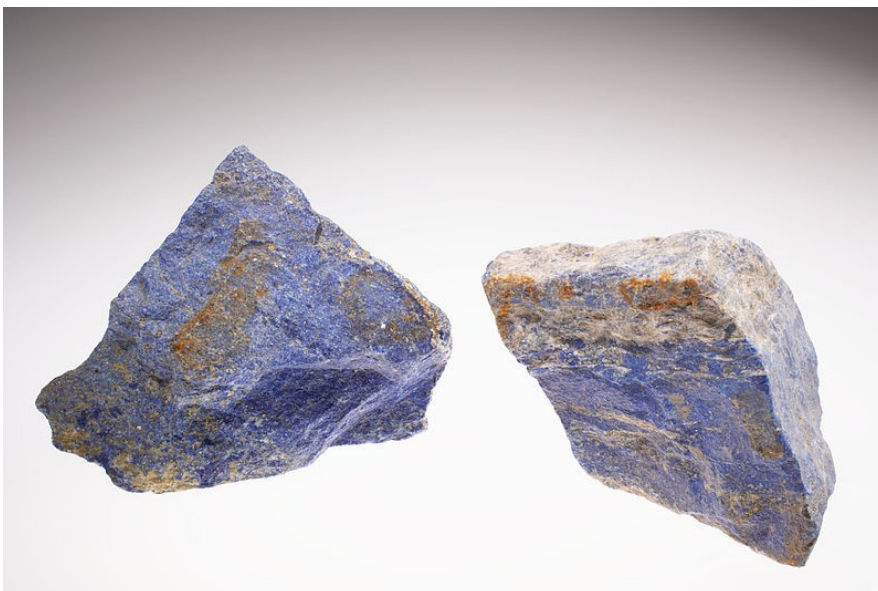
Lapis rough License: CC0 Public Domain