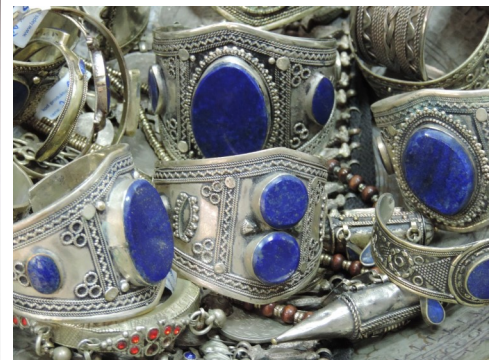
License: CC0 Public Domain