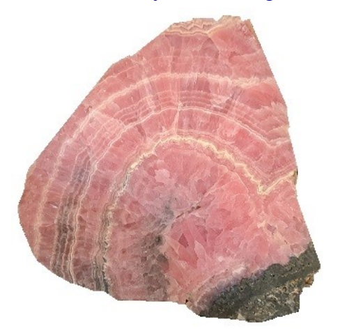
The JALAF for September is Rhodochrosite

Rhodochrosite is a manganese carbonate mineral that is pink with white banding in the most common form and is a bright red crystal in the rarest. Rhodochrosite makes an attractive cabochon for use in jewelry but it is a relatively soft stone, so it is best to use in earrings and pendants rather than rings, where they can be damaged by contact with hard surfaces. If you have rhodochrosite in any form, bring it to the September meeting for the JALAF, or just for show and tell.